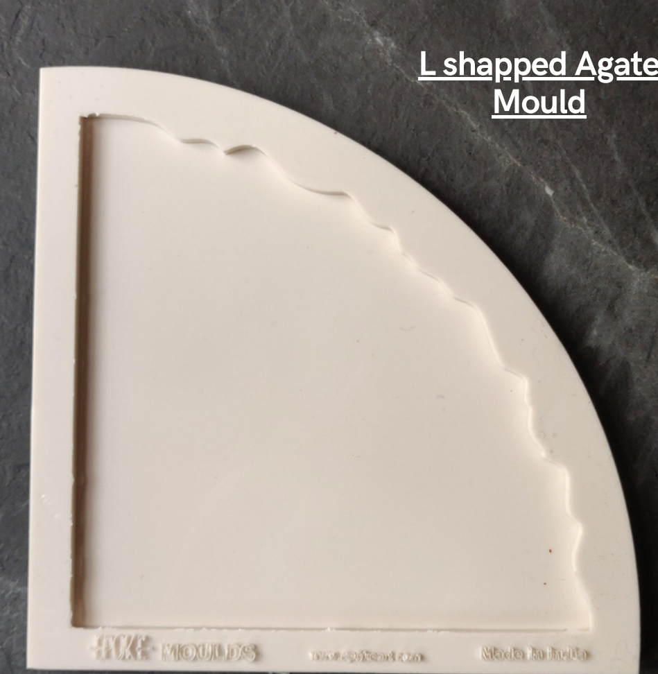
L shaped Agate Mould