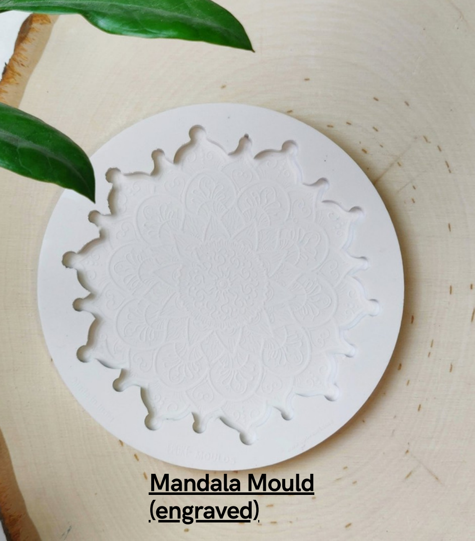
Mandala Mould (engraved)