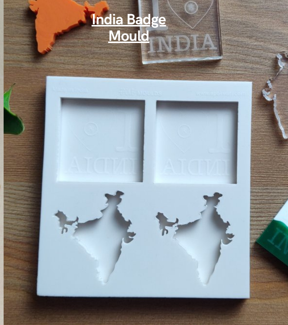
India Badge Mould