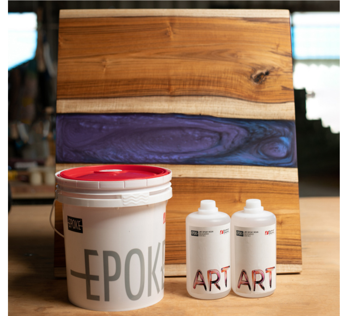
Semi Pro Kit